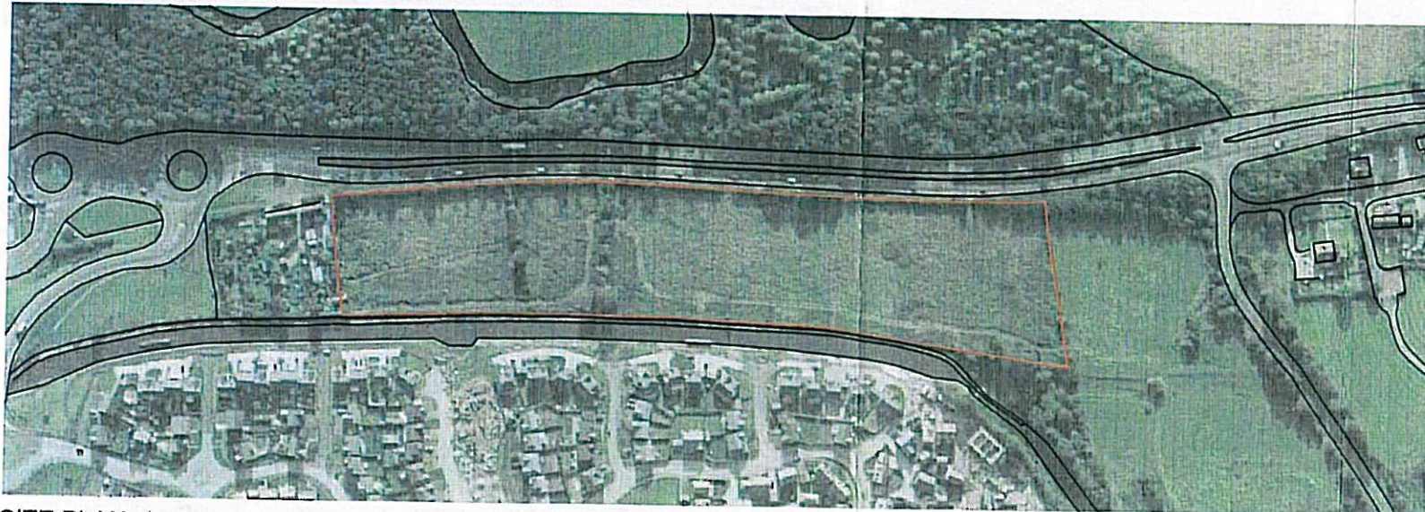
SITE PLAN 1:2500