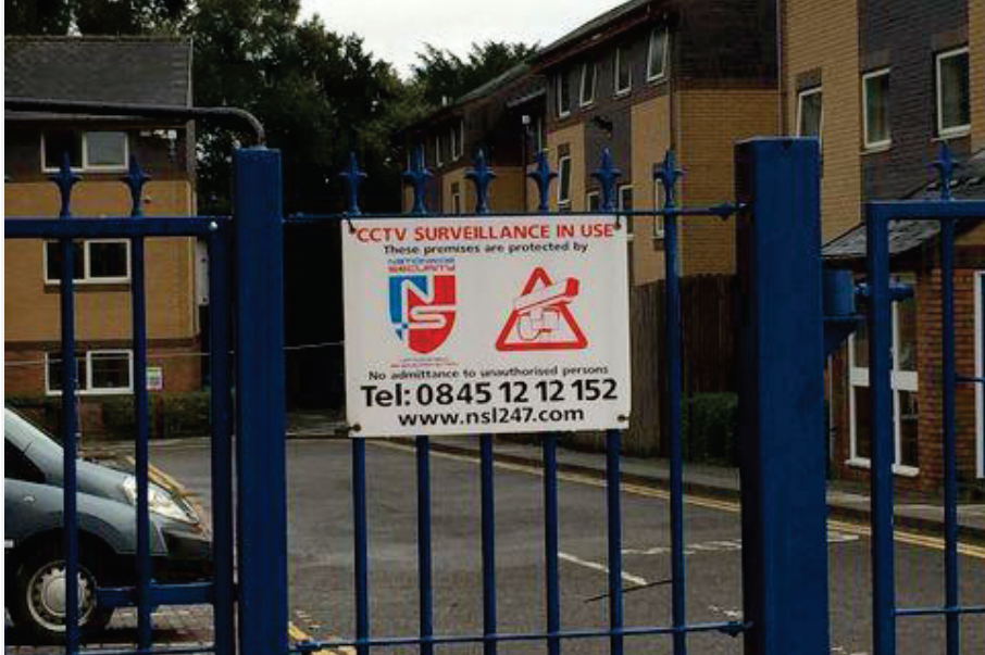
"Recently, I saw people obviously drunk on the seats and also urinating in full view at 4.30pm, making no effort to cover himself or turn in the other direction."

The asylum seeker reception centre was given the go-ahead last October when city planning councillors approved a change of use for the university building.