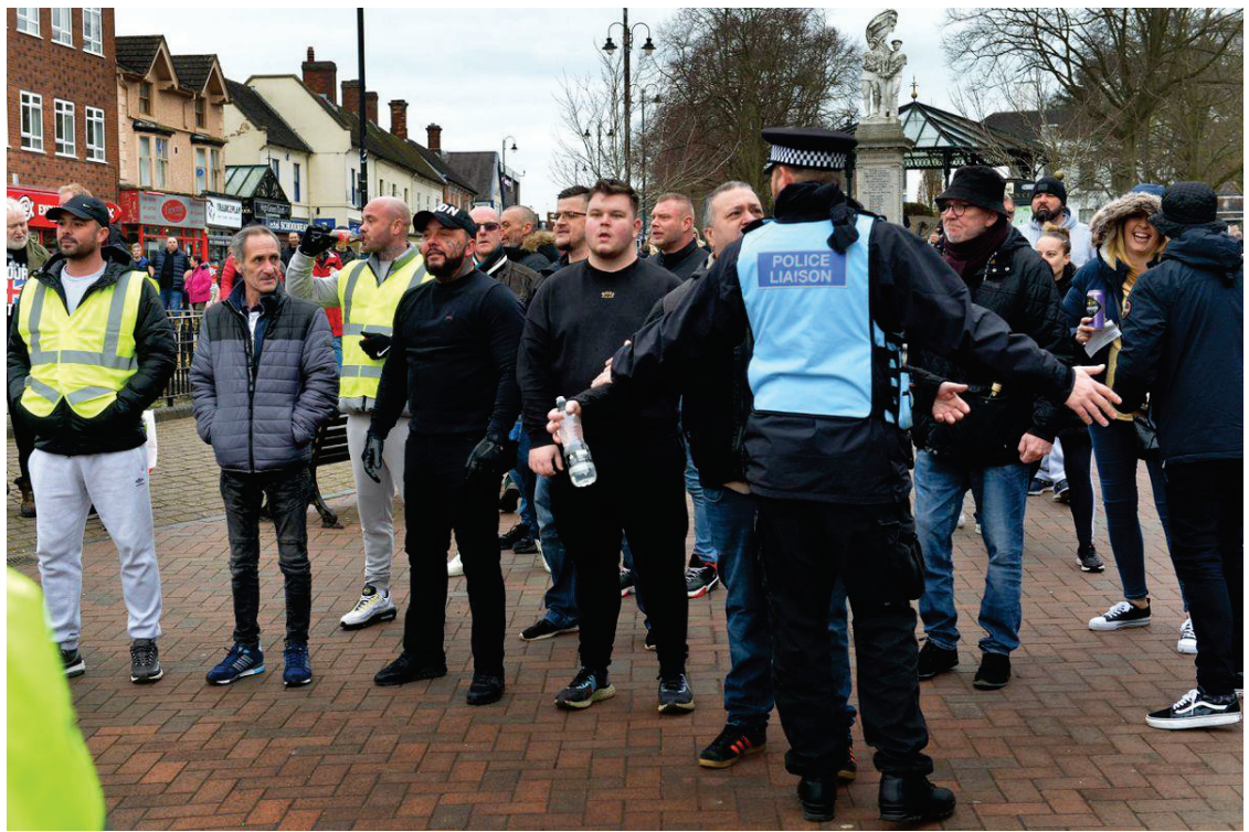
In Cannock town centre

"It's about time and it's about time the Government heard our voices. We're not racist one little bit, we just want the Government to see that we've had enough of this."