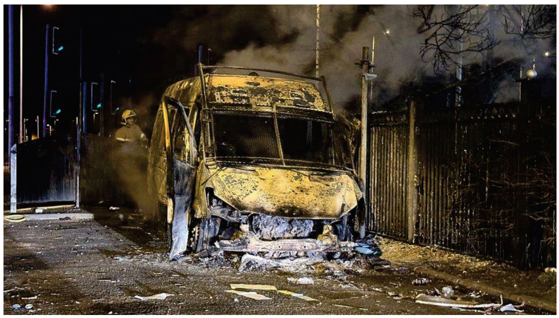
A police van was set on fire after a protest turned violent in Kirkby

The initial protest had been triggered by an allegation that a man had made inappropriate advances to a local teenage girl.