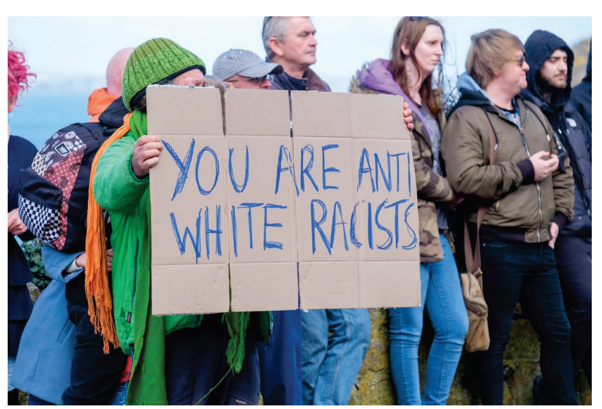
Protesters from nationalist group Patriotic Alternative face anti-fascists from Cornwall Resists, during a protest, organised by the far-right group (PA)