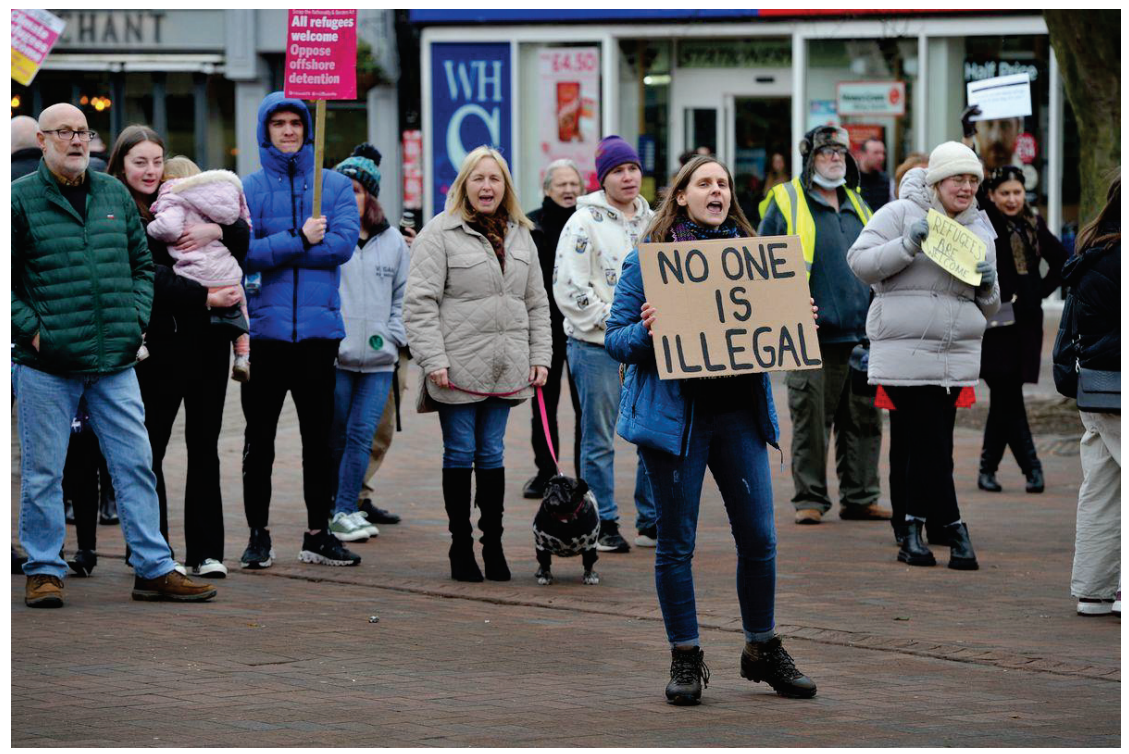
The counter demonstration

protesters, with a line of police forming to act as a 'barricade' between both sides and ensuring the demonstration remained peaceful.