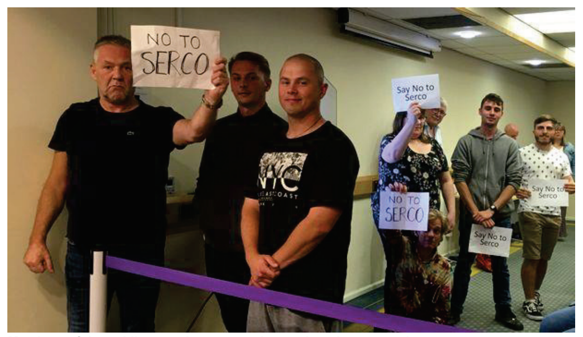
Members of the public were there protesting against the proposal (Image: LDRS)

"They don't want to cope with 400 single males who will be able to wander around unhindered. There is a suggestion to build a wall to protect them from local residents and I find that really insulting."