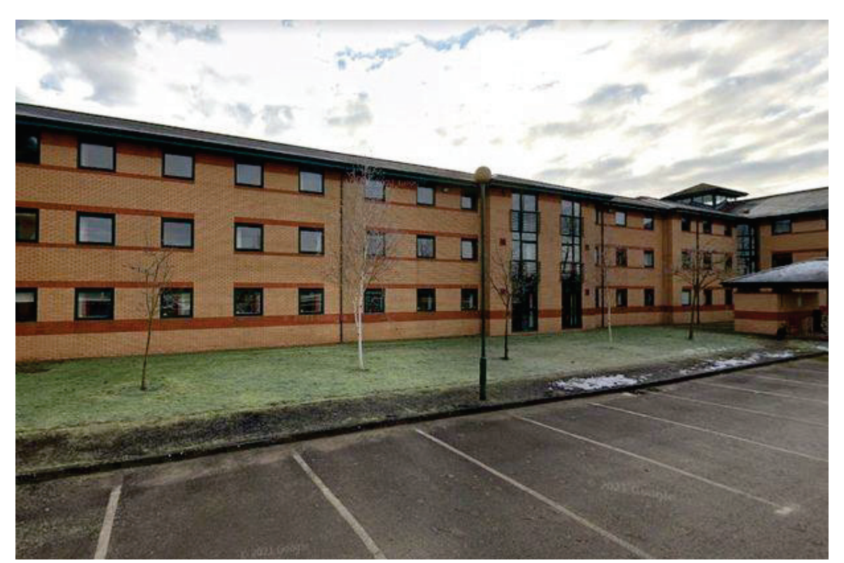
More than 400 asylum seekers could have been housed at the former Staffordshire University halls in Stafford.