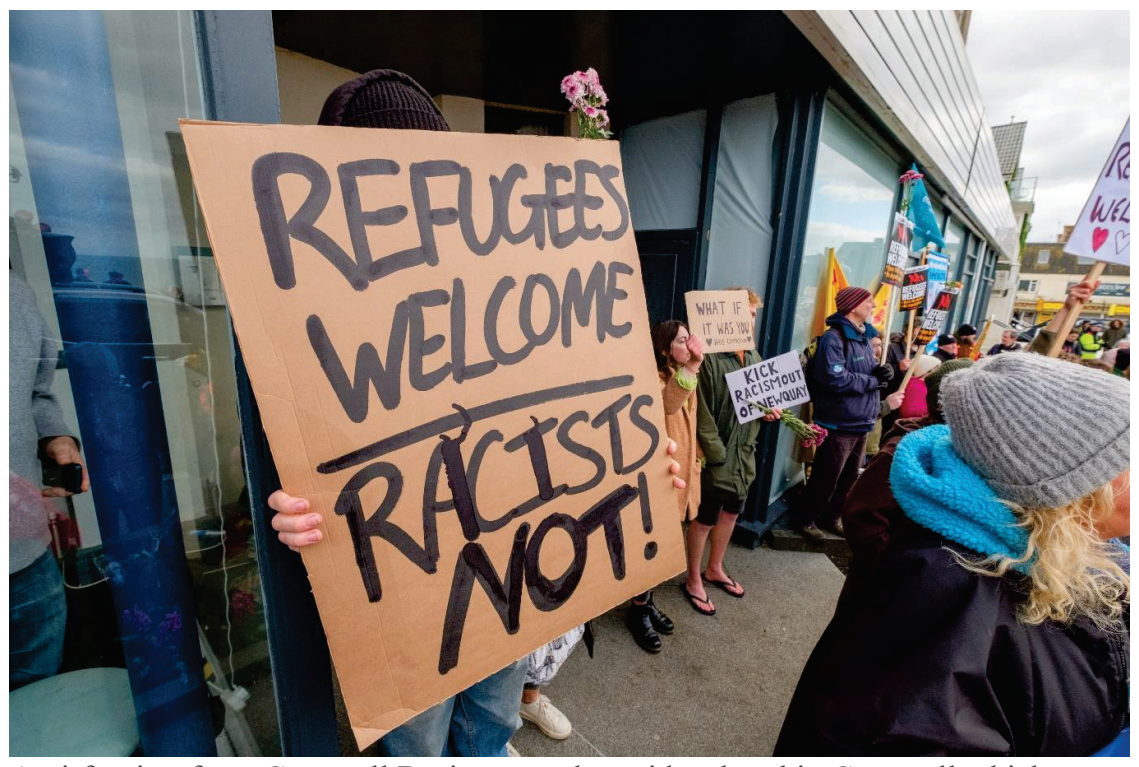
Anti-fascists from Cornwall Resists, stand outside a hotel in Cornwall which houses refugees

"During the day, our officers engaged with protesters, members of the local community, and visitors to the town while they were on patrol to help ease concerns and diffuse tensions."