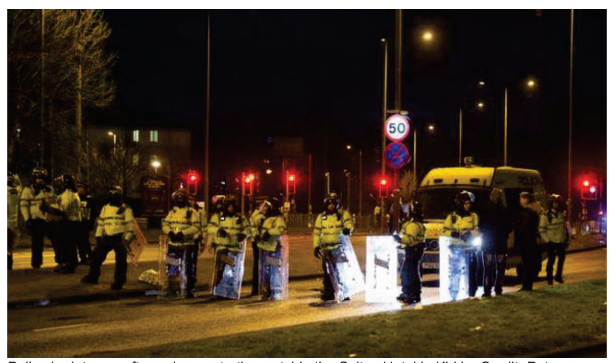
Police in riot gear after a demonstration outside the Suites Hotel in Kirkby.

The figures, from the Home Office, show around 166,000 asylum seekers are waiting for a decision on their future, the highest for over 30 years.