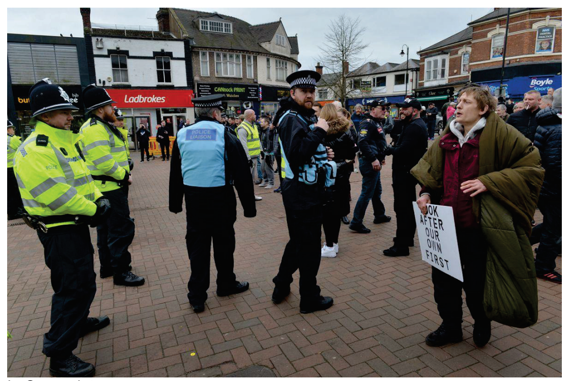
In Cannock town centre

Protesters who walked behind the "deport not support" sign insisted the message was not a racist one, and complained about hotels in Staffordshire being used as accommodation for asylum seekers.