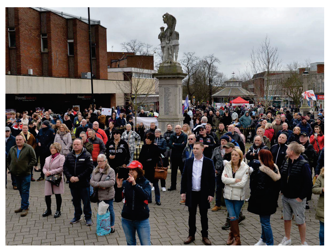
The demonstration in Cannock town centre

Police were on hand for a demonstration in a Staffordshire town centre by people calling on the Government to take a harder line on immigration, as well as counterprotesters with welcoming messages for refugees.