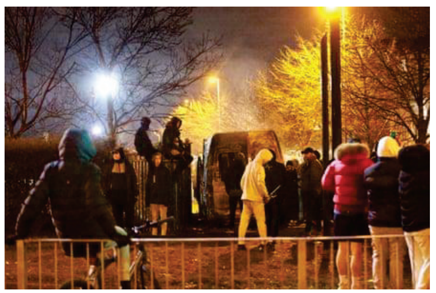
Several hundred people attended the demonstration at a hotel housing asylum seekers.

Merseyside police said there had been no reports of any injuries.