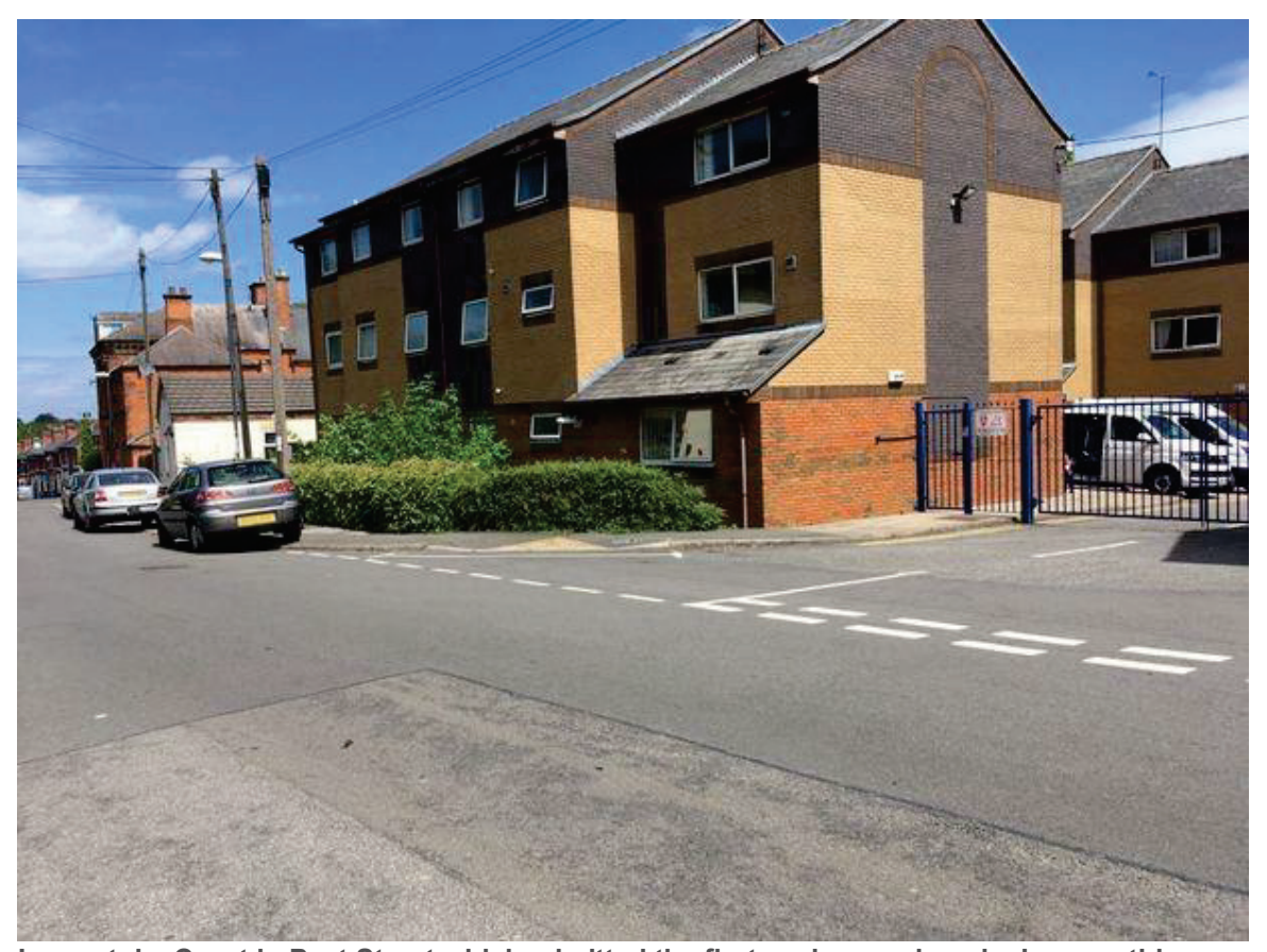
Laverstoke Court in Peet Street which admitted the first asylum seekers in January this year

"I will also ask our community protection officers to visit the area as they can take action against anti-social behaviour such as public drinking and disorder as well as fly tipping and littering."