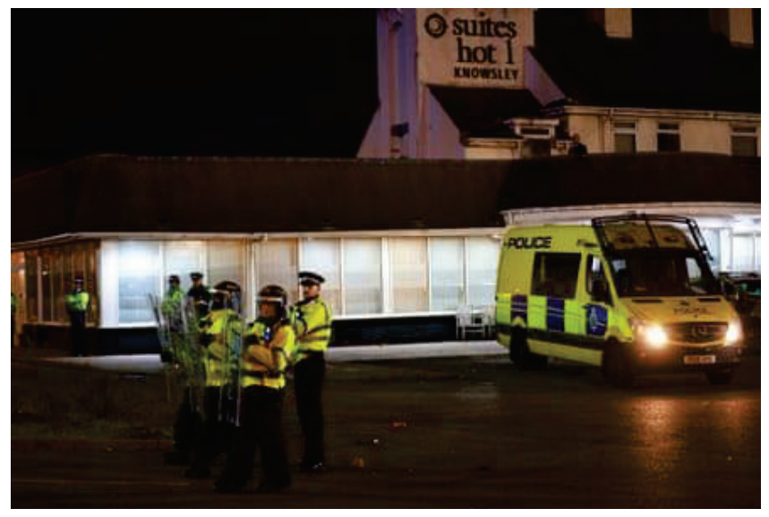
Merseyside police said additional officers were in the area and monitoring the situation closely.

"The people of Knowsley are not bigots and are welcoming to people escaping from some of the most dangerous places in the world in search of a place of safety. Those demonstrating against refugees at this protest tonight do not represent this community. We are not like that and overwhelmingly behave with sympathy and kindness to others regardless of where they come from."