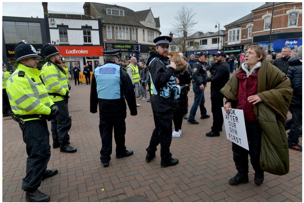
In Cannock town centre

Protesters who walked behind the "deport not support" sign insisted the message was not a racist one, and complained about hotels in Staffordshire being used as accommodation for asylum seekers.