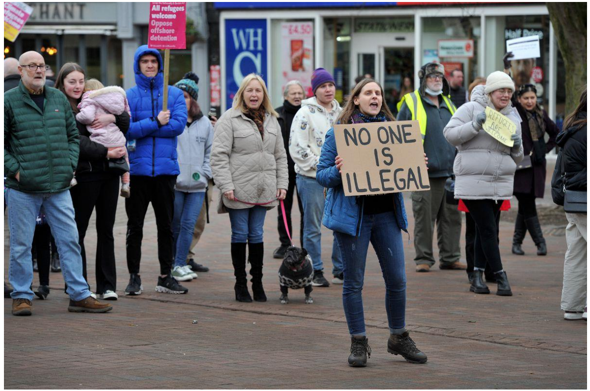
The counter demonstration

protesters, with a line of police forming to act as a 'barricade' between both sides and ensuring the demonstration remained peaceful.