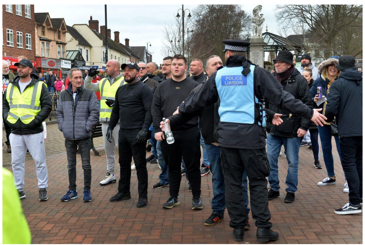
In Cannock town centre

"It's about time and it's about time the Government heard our voices. We're not racist one little bit, we just want the Government to see that we've had enough of this."