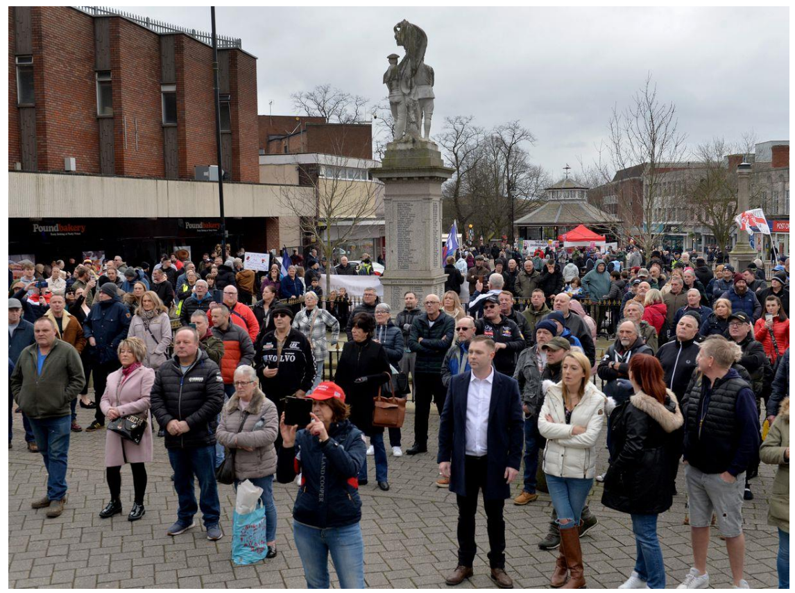
The demonstration in Cannock town centre

Police were on hand for a demonstration in a Staffordshire town centre by people calling on the Government to take a harder line on immigration, as well as counterprotesters with welcoming messages for refugees.