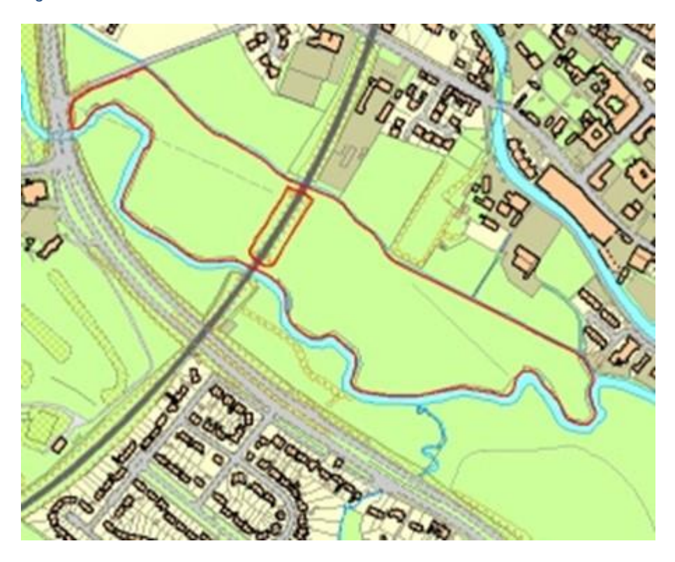
Figure 3 Southern Meadow